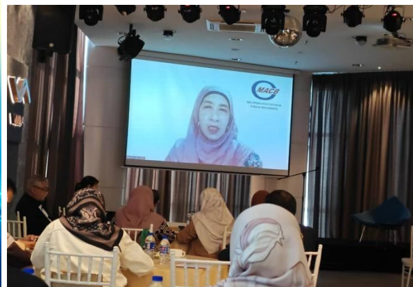
Opening remarks by MACB President