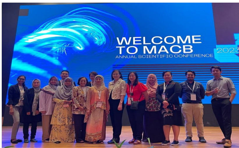
MACB Council with the 33 rd Conference organising committee at the closing ceremony