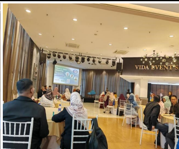
Participants at HbA1C User Meeting

Overall, it was a fruitful meeting with 33 physical attendees and 134 virtual attendees who joined on Microsoft Teams. Feedbacks received were on average of 4.5 out of 5.