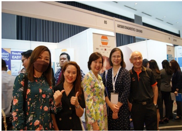
33 rd MACB Conference – participants at the exhibition booth area