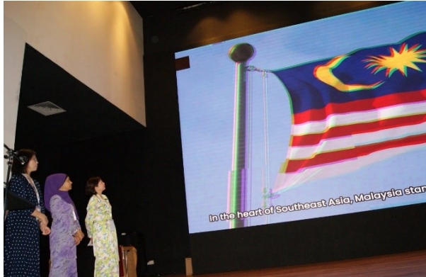
33 rd MACB Conference 2023 Opening Ceremony