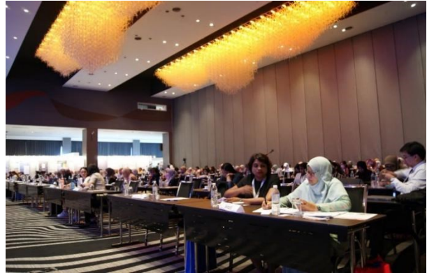
Participants at the 33 rd MACB Conference 2023