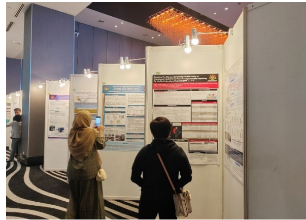
33 rd MACB Conference poster presentations