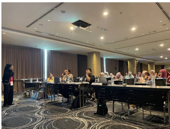
Question and Answer session