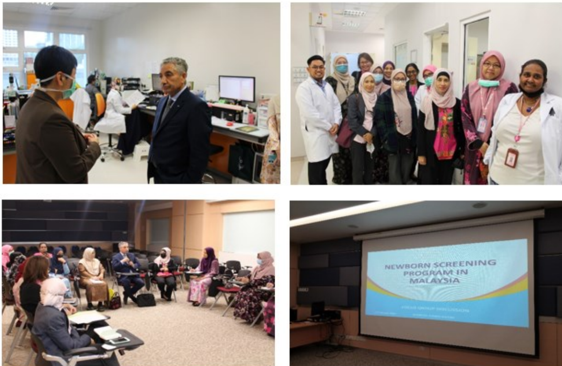
Picture 4: Discussions during the IFCC President’s laboratory visit to Paediatrics Hospital (Hospital Tunku Azizah), Kuala Lumpur on 27 th March 2023