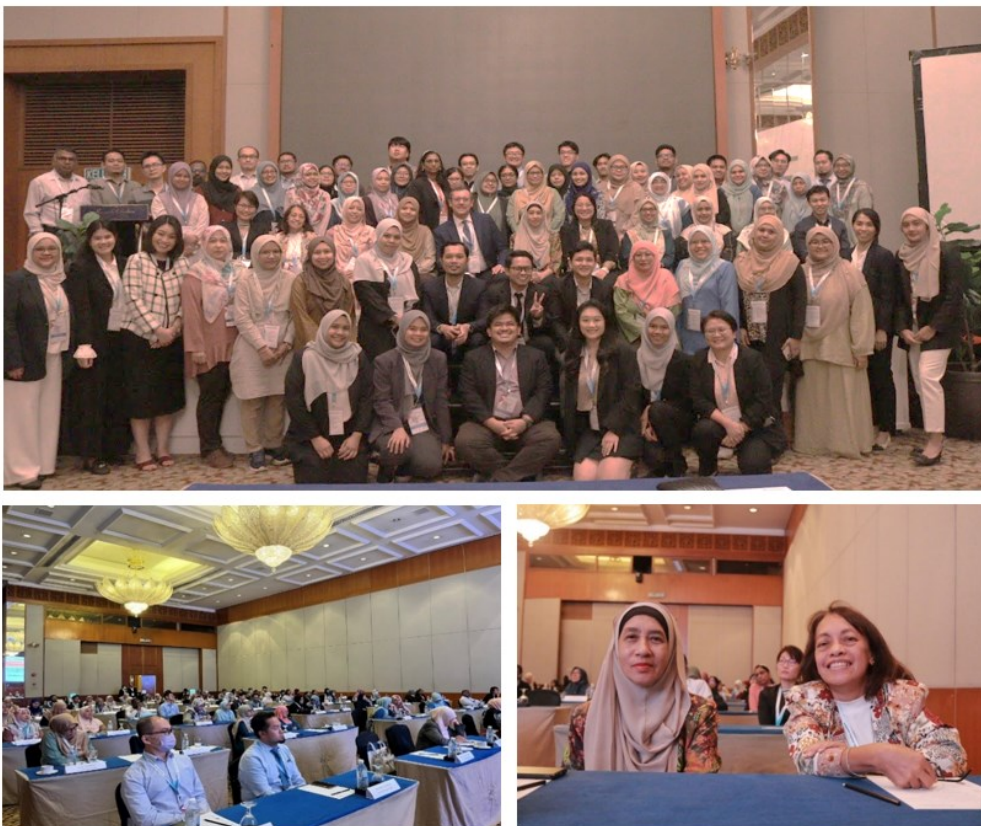
Picture 7: Participants at the National ABG Symposium at Hotel Royale Chulan, Kuala Lumpur on 12 th July, 2023.

The National ABG Symposium: Updates on Latest ISO 15189 and iQM was held at Royale Chulan Hotel, Kuala Lumpur on 12 th July, 2023. The symposium under the auspices of Malaysian Association of Clinical Biochemists (MACB) was jointly organized with Straits Scientific and Werfen. Over 70 people attended the Symposium comprising of a virtual session, a number of lectures and interactive discussions with Blood Gas equipment users.