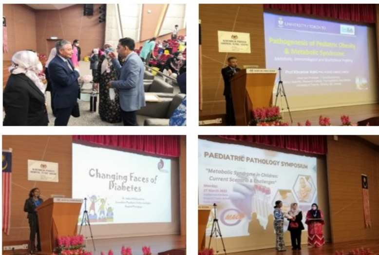
Picture 3: MACB Paediatric Pathology Symposium on 27 th March 2023 in conjunction with IFCC President's visit to Malaysia