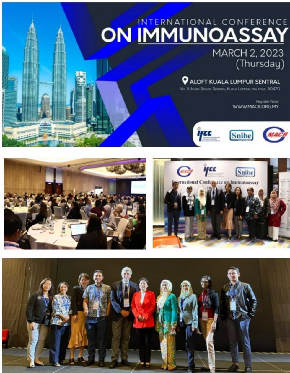
Picture 1: International Immunoassay Conference organised by MACB, IFCC and SNIBE at the Aloft Hotel, Kuala Lumpur Sentral on 2 nd March 2023.

An International Conference on Immunoassay was held on 2 nd March, 2023, at the Aloft Hotel, Kuala Lumpur Sentral, jointly organized by the Malaysian Association of Clinical Biochemists (MACB), the International Federation of Clinical Chemistry and Laboratory Medicine (IFCC), and SNIBE. The conference was attended by more than 300 delegates from Malaysia and other Southeast Asian countries, namely Indonesia, Philippines, Thailand, Myanmar and Vietnam.