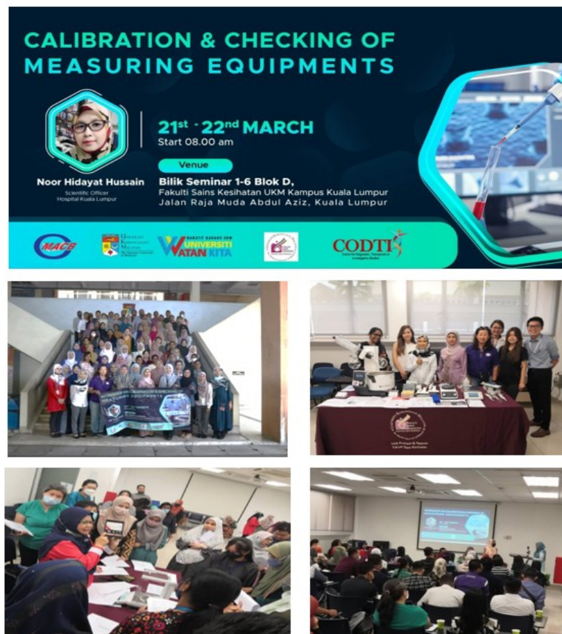
Picture 2: MACB Workshop on Calibration & Checking of Measuring Equipment in UKM, Kuala Lumpur on 21 st -22 nd March 2023.

Malaysian Association of Clinical Biochemists organized a workshop on “Calibration & Checking Of Measuring Equipment” on 21 st -2 nd March 2023. The event was a collaboration with the National University of Malaysia and was held at the Faculty of Health Science, UKM, Kuala Lumpur.